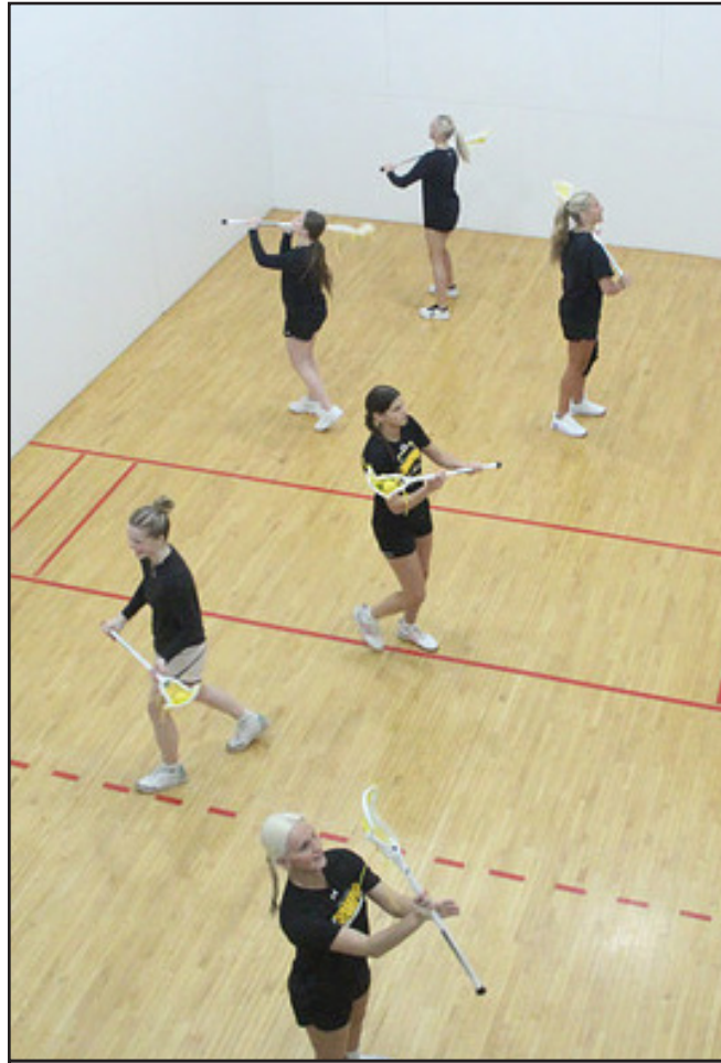
Lacrosse players hold their first ever practice inside the racquetball courts at the Marcovich Wellness Center on Mar. 17.

The early roster is small and largely new to the sport. Only about half of the players have prior lacrosse experience, and all but one are dual-sport