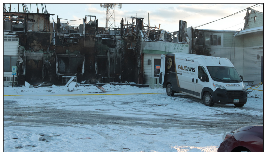
Superior & Sage Hotel's front door with Paul Davis Restoration van parked outside on Feb. 24.