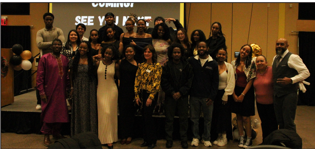
Group photo after Soul Food Dinner of BSU members and attendees on Feb. 28.