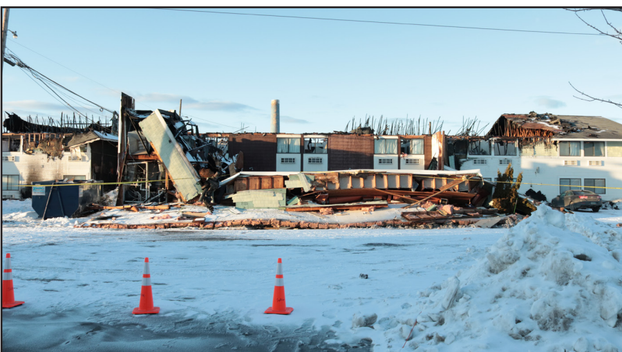
View of Superior & Sage Hotel from Hammond Street Kwik Trip on Feb. 24.