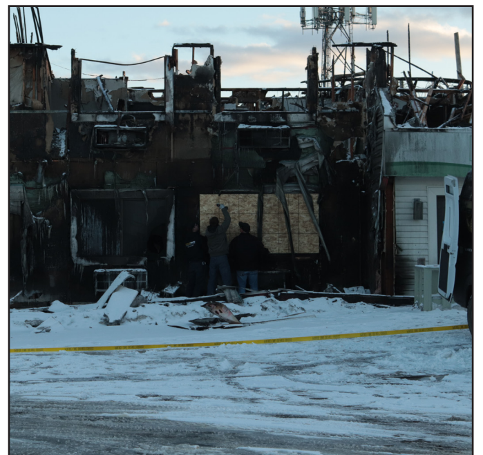
Paul Davis Restoration team boarding up the windows of Superior & Sage Hotel on Feb. 24

SFD asks the public to avoid the area at this time.