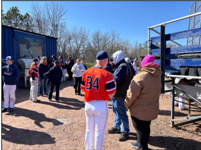
Northland College's final NCAA home game was a family event, with food for the players and their families.

stated that the conference will continue into the future as a seven-member competition, rather than seek out an immediate replacement for Northland.