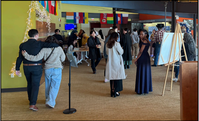
Photo of guests arriving at the 25th Annual Cultural Night in the Yellowjacket Great Room.

Smiles, connections, and building relationships were seen throughout the whole night, along with learning about different cultures. UWS helps offer this special night for students who could never have this opportunity again in their lives, and it happens once a year at UWS.