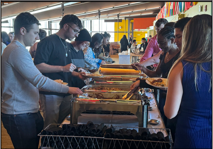
Photo of guests talking and plating their food at Cultural Night.