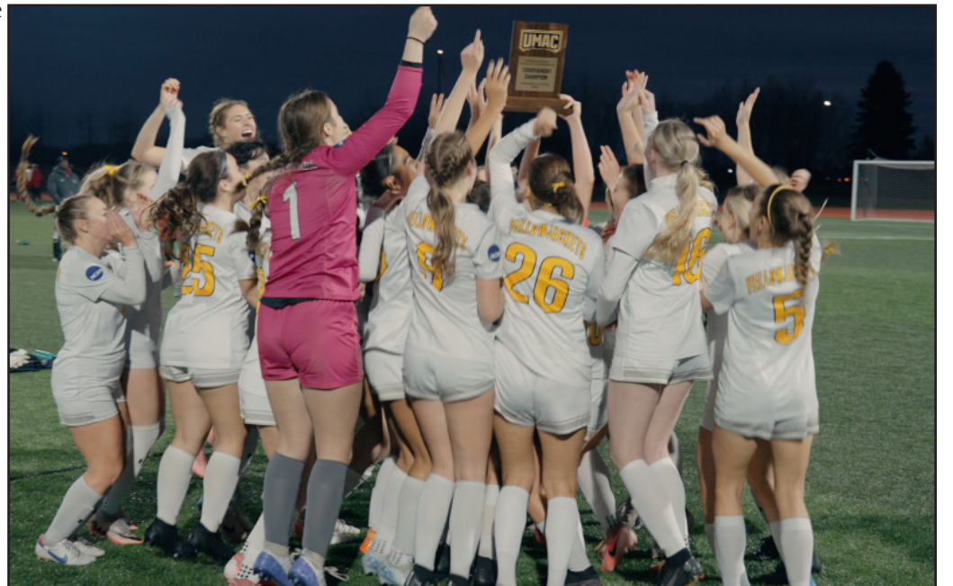
UWS women's soccer earned their four consecutive UMAC title on Saturday, Nov. 9, at SCCU Stadium.

The Jackets earned a spot in the NCAA tournament and face Carleton College.