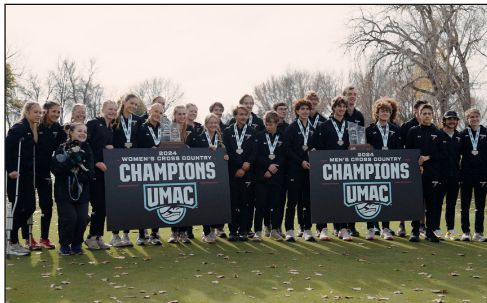
UWS men's and women's cross country team earns UMAC titles at conference meet in Winthrop, Minn.