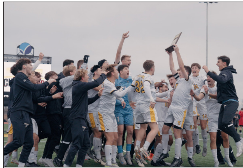
UWS men's soccer earns eighth straight UMAC title on Saturday, Nov. 9th at SCCU Stadium.