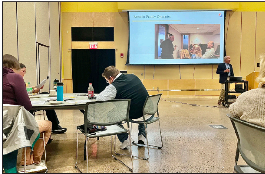
Braver Angels workshop powerpoint presents skills on how to have a healthy political conversation with family members.

The workshop took place on Oct. 24 in the Great Room of the Yellow-jacket Union. Braver Angels will be hosting another workshop on Nov. 21 titled as "Skills for Disagreeing Better." More information about the workshop and the organization Braver Angels can be found at BraverAngels.org.