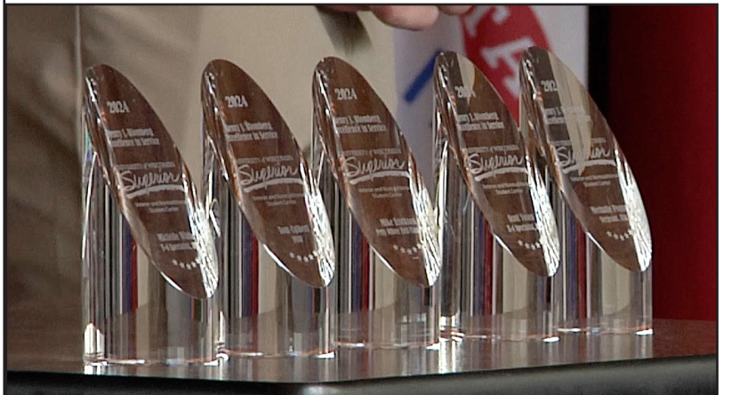
Five awards given out on Veterans day to honor the veterans for their excellence in service.

UWS offers coaching programs, like Sucess Net, for both veteran and nontradition students. To enroll in Sucess Net, visit the Veteran Resources tab on the campus website.