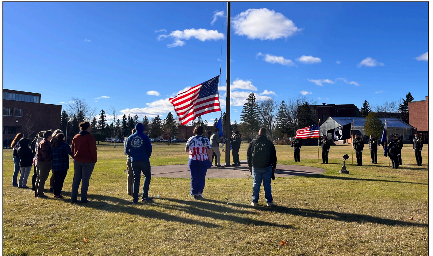
Students, faculty, staff, supporting community and family members gathered outside at the UWS campus flag pole, raising the flag up to half-staff in honor of all veterans.