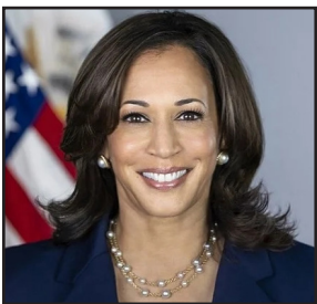
Kamala Harris/Tim Walz 70,383,093 votes 47.9%