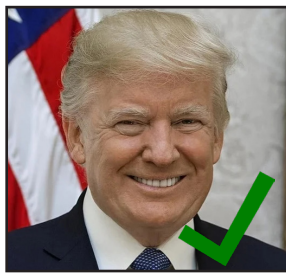
Donald Trump/J.D. Vance 74,312,688 votes 50.6%