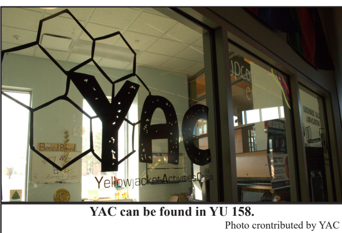
YAC can be found in YU 158.

To find more information on future YAC events you can visit the UWS campus calendar or YAC’s Facebook page.