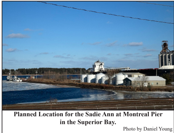
Planned Location for the Sadie Ann at Montreal Pier in the Superior Bay.