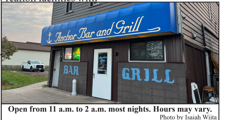
Open from 11 a.m. to 2 a.m. most nights. Hours may vary.

In the next coming months, Donahue emphasized that the plan was to slowly but surely once again incorporate more fitness programming into the lives of Superior Students.