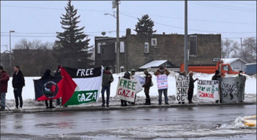
Protesters gathered outside of Earth Rider Brewery on Jan. 25, 2024, in support of Gaza, calling for President Biden to bring ceasefire in the Gaza Strip and Israel.