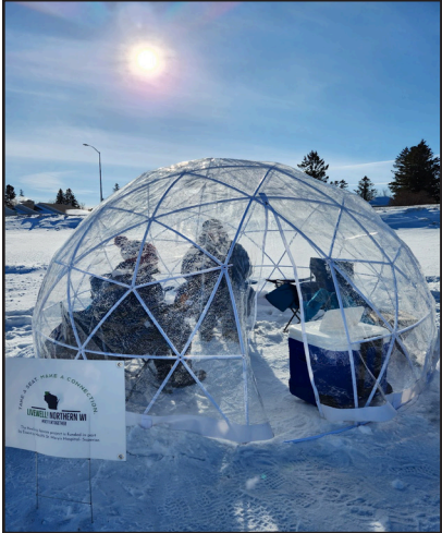
Live Well’s Pop-Up Domes

The first spot these were found was at the Ice Festival at Barkers Island. They have made it out a few more times since the snow melted, once at UWS and once at a recent