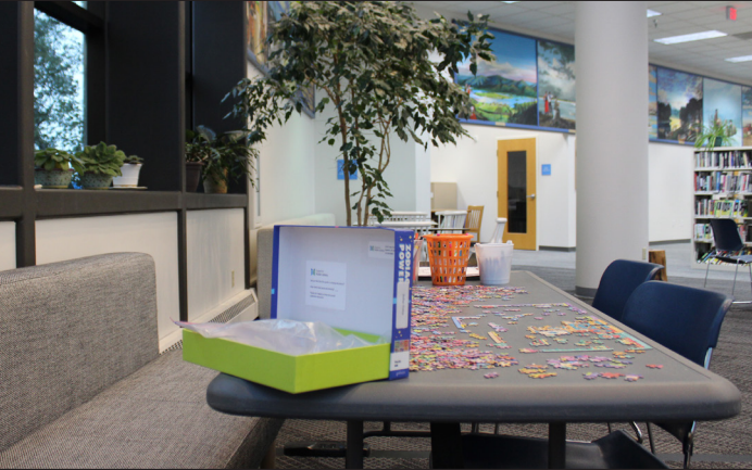
Live Well’s welcoming space at the Superior Public Library tries to bring people together with a puzzle.

Activities taking place after Oct. 6 include a chat about cooking and processing venison, a book club for fans of William Kent Krueger, a Barker’s