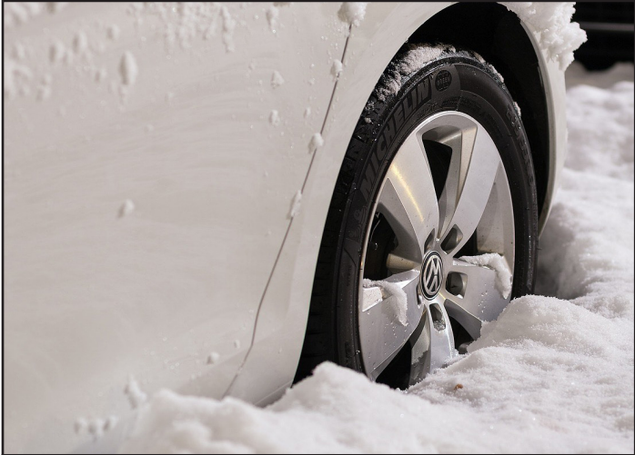
The 2022-2023 winter season dropped 68 inches of snow onto Superior, according to the National Weather Service.

Keep a bag of sand in your car so that if you do happen to get stuck, you can pour some