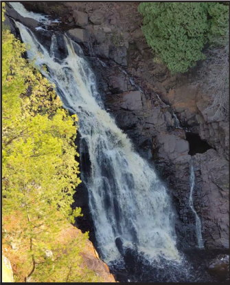
Big Manitou Falls is 165 ft. drop along the Black River. File photo from 2022

Pattison State Park Explore the vibrant fall foliage on the trails of Pattison State Park, home to Wisconsin's highest waterfall, Big Manitou Falls. This 20-minute drive from campus is the perfect opportunity to clear your head and get a good hike in!