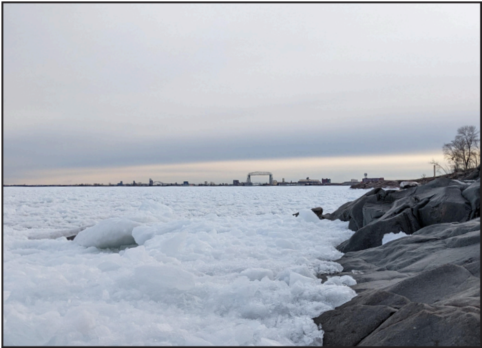
Duluth beat their record of snowiest winter on record on April 20, 2023. Total snowfall was 137.1 inches, breaking the 135.4 inch snow season from 1995-1996.

UWS will send out a mass email in events of parking lots being plowed. Flyers will also be placed around resident halls.