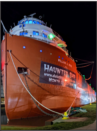
Haunted Ship File photo from 2021

This Fall Bucket list offers a diverse array of outdoor adventures and community events that capture the essence of autumn in the Northland. With breathtaking foliage, cozy bonfire moments, and lively city celebrations, Superior's fall offerings are a testament to its unique charm and the beauty of the changing seasons. So, grab your flannel and pumpkin spice latte and make unforgettable memories in Superior this fall.